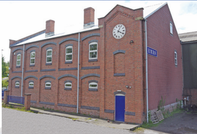
Exterior of the Museum and Study Centre

We offer a large selection of transfers in both 4mm and 7mm scales that have long been the first choice of the discerning modeller.