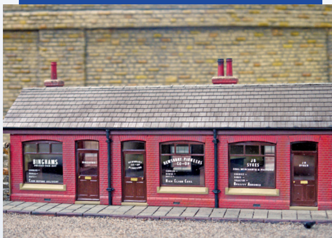
Building on Dewsbury Goods lettered with HMRS transfers

Membership is open to anyone interested in the aims of the Society. Visit our 'Membership' page at www.hmrs.org.uk for current prices and information on how to join.