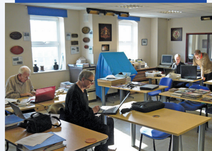
Activity in the Study Area

The centre is manned by volunteers who are present at times every week and also on certain weekends during the summer months. Entry is free. It is always best to ring or email to confirm that someone is going to be there.